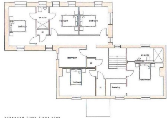
proposed first floor plan