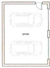
proposed ground floor plan