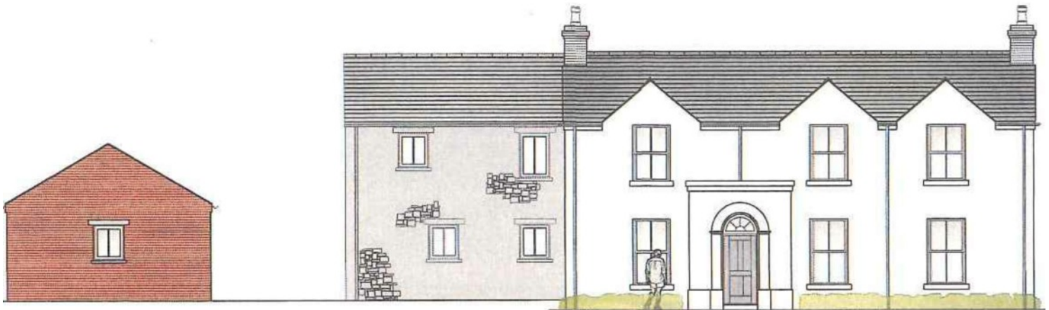
proposed north west elevation

An attractive building site extending to \frac{3}{4} of an acre with Full Planning Permission for a two storey 3,135 sq. ft. dwelling plus garage with views over the surrounding countryside. The site is conveniently located in a desirable rural area within walking distance of The Chestnut Inn, 2 miles from the village of Ballygowan and 12 miles from Belfast city centre.